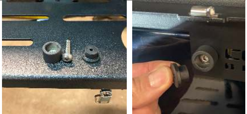
Fig. Cup Washer and Bumper