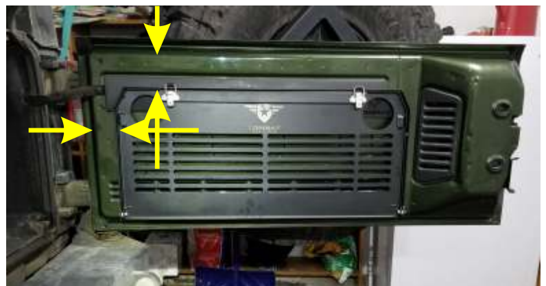
Fig. Locating Reference Edge