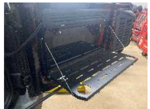
Fig. Finished Installation

WARNING: Cancer and Reproductive Harm - www.P65Warnings.ca.gov