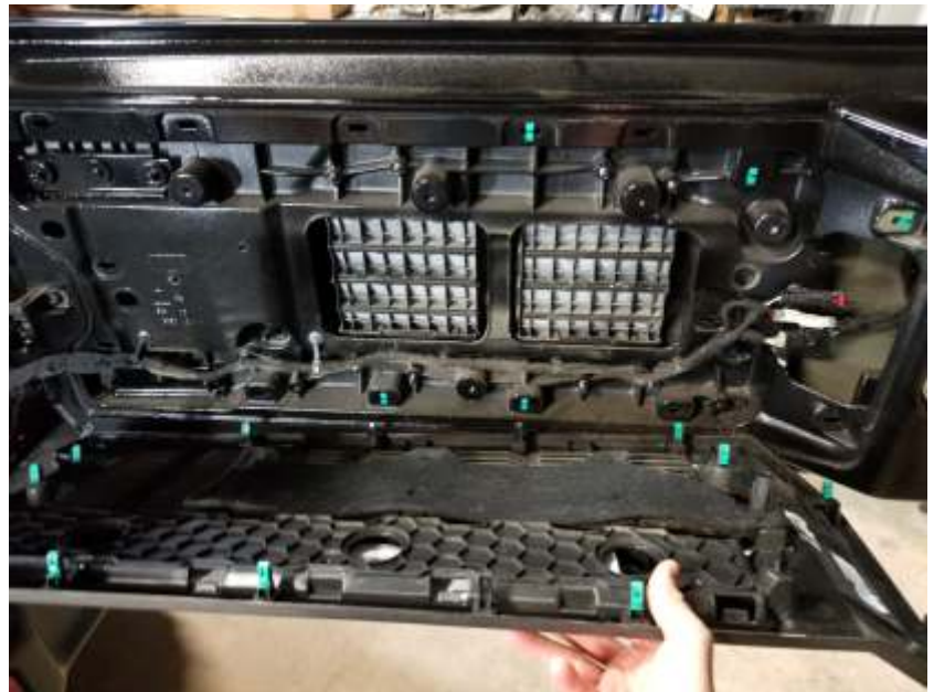
Fig. Removing the Trim Panel from the Tailgate