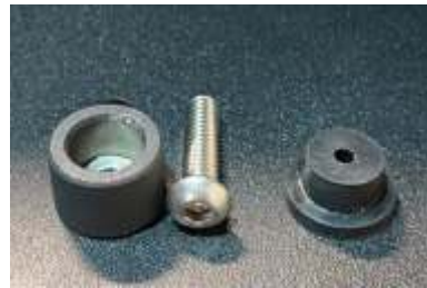
Fig. Cup Washer and Bumper