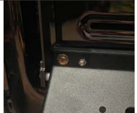
Fig. Left Hand Hardware Location