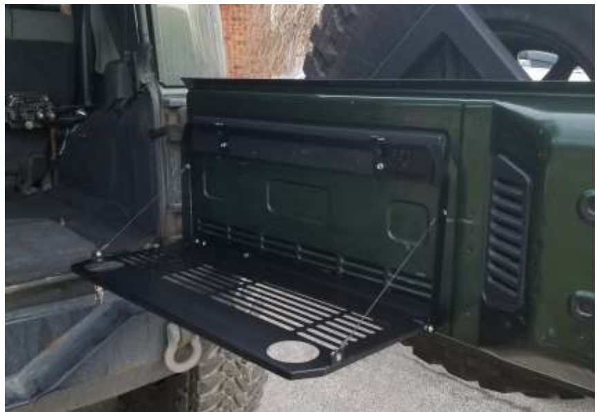
Fig. Finished Installation