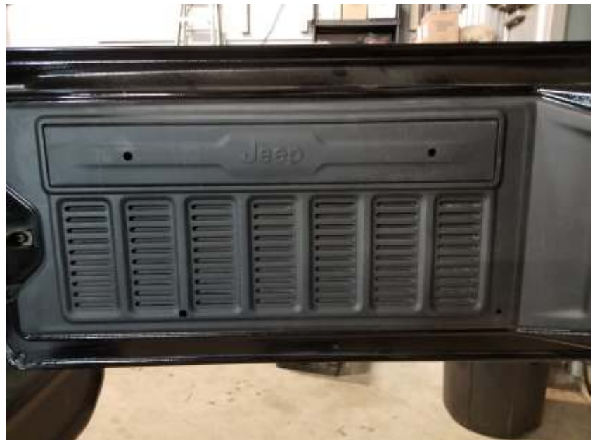
Fig. Finished Trim Panels with Holes