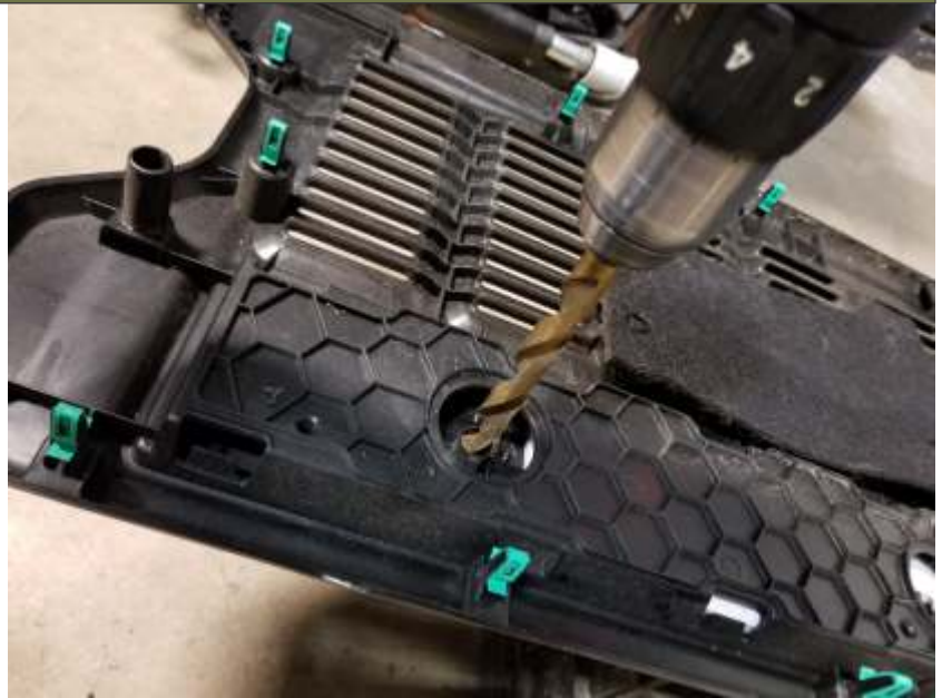
Fig. Drilling Mounting Holes

Reinstall the plastic trim panel back onto the tailgate.