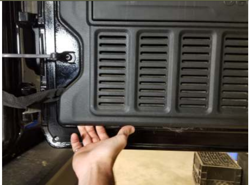
Fig. Removing the Trim Panel from the Tailgate

NOTE: If you have the “TrailRail Storage System” you will remove it with the a T40 torx bit at the 3 mounting locations.