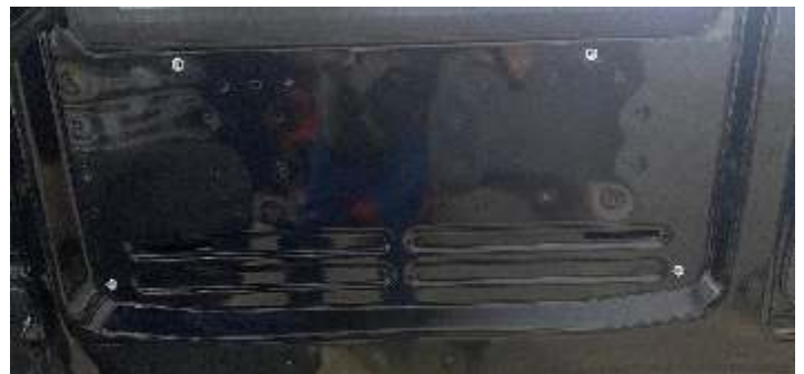
Fig. Rivnut Installation