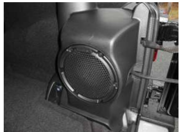
Fig. Factory Right Hand Subwoofer